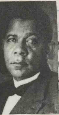
Booker T. Washington

Few things help an individual more than to place responsibility upon him, and to let him know that you trust him.